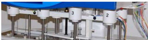
Automated Sampling Manifold