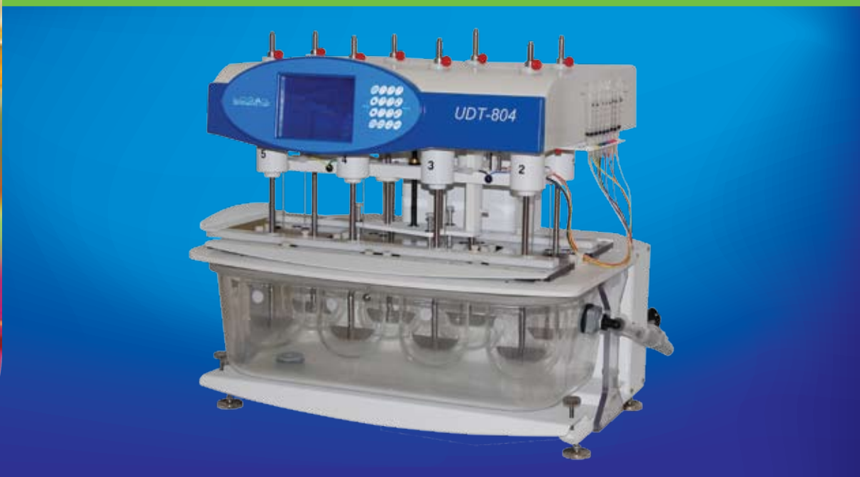
Universal Dissolution Tester (USP 1, 2, 5 & 6)

The UDT-804 Universal Dissolution Tester is the newest apparatus for dissolution testing required by USP. This 8-vessel dissolution tester is designed for easy operation and built to operate continuously. The two additional vessels can be used for blank, standard or media replacement. Several options are available with the UDT-804 including: an Automated Sampling Manifold to interface the dissolution tester with other instruments such as UV or HPLC systems, a Tablet-Dropping Tray/one-piece vessel cover, a Control/Calibration/Validation Software package and an external printer. UDT-804 performance exceeds the requirements of USP, BP, EP and JP.