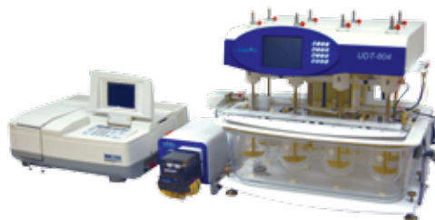
LOGAN SYSTEM 800S AUTOMATED DISSOLUTION UV SYSTEM