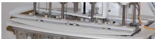
Automated Dropping Tray & Vessel Cover