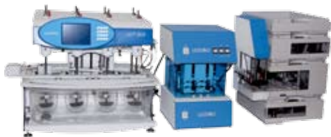
LOGAN SYSTEM 900A AUTOMATED DISSOLUTION HPLC SYSTEM