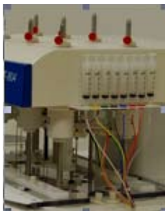
EZ-SAM: Easy Sampling System